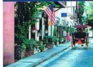
Historic St. George St