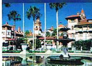
St. Augustine, our Nation's Oldest City

Day 7: After enjoying a Continental Breakfast, you will depart for home... a perfect time to chat with your friends about all the fun things you've done, the great sights you've seen and where your next group trip will take you!