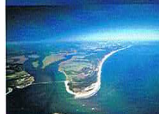
Aerial view of Amelia Island